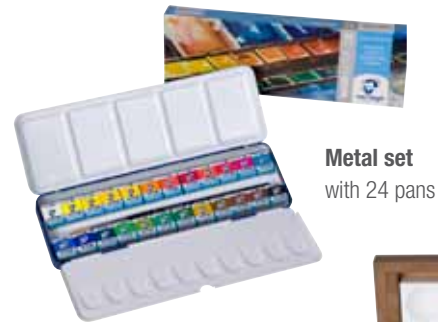
Metal set with 24 pans