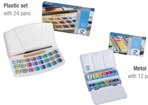
Metal set with 12 pans